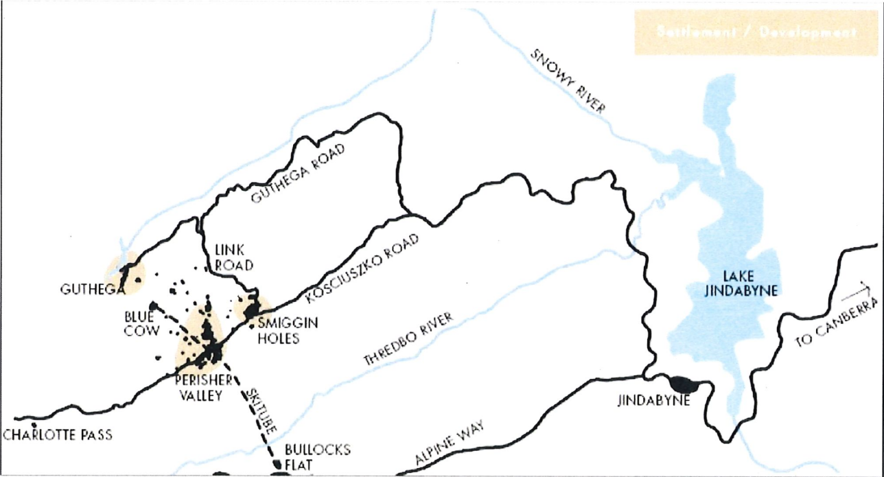
Figure 1: Location of Perisher Valley in context with the Region

The location of Perisher Valley is illustrated in context with the regional locality below: