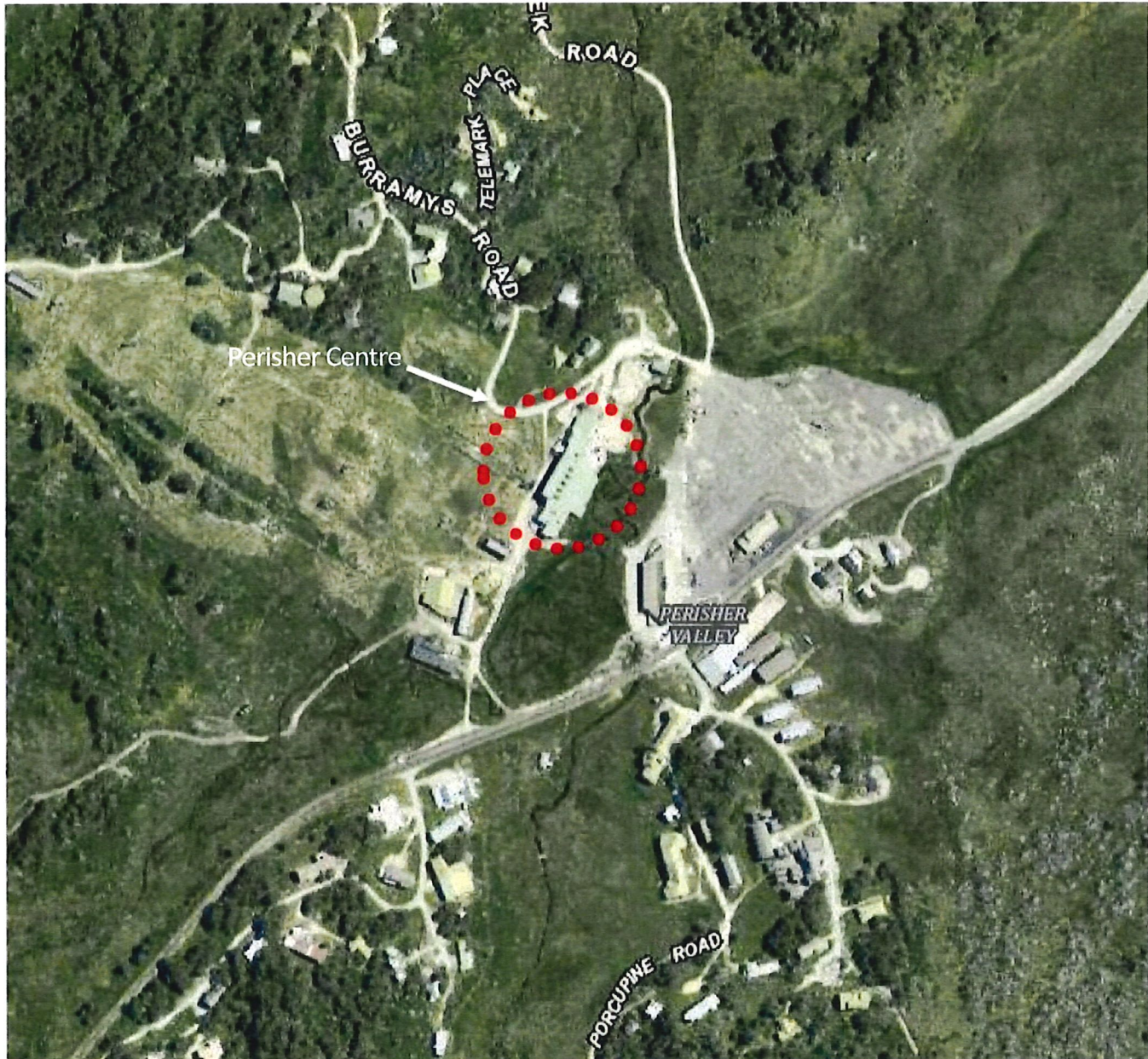
Figure 2: Context of the site within the locality

The location of the site in context with the locality is illustrated in Figure 2 below: