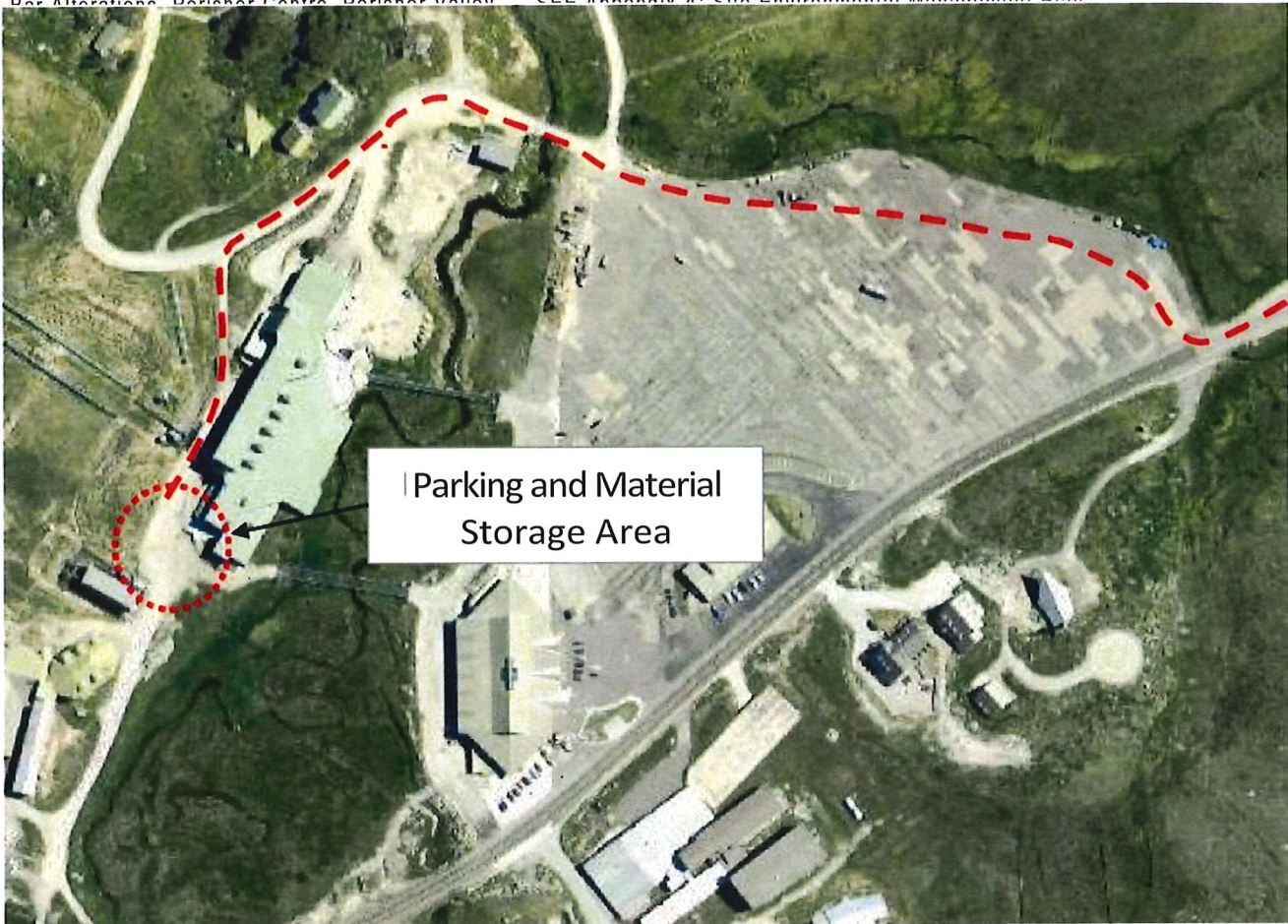
Figure 2 - Aerial map showing access road and car parking area.